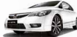
Civic (year model 2006 - 2011)