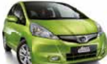
Jazz (year model 2009 - 2013)