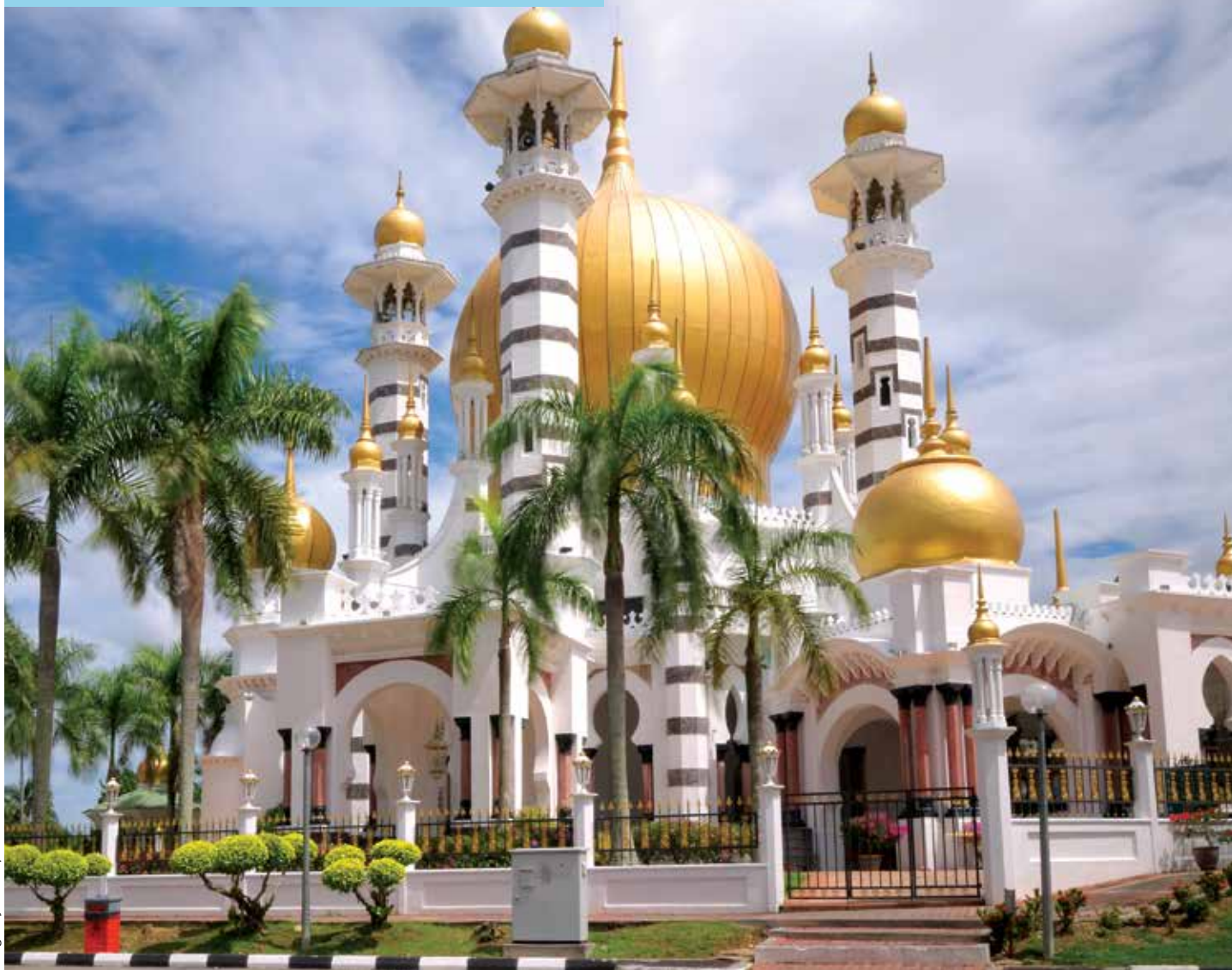
Ubudiah Mosque, Kuala Kangsar, Perak

The mosques of Malaysia are more than just holy places of prayer and preaching; its designs are architectural wonders worthy of admiration.