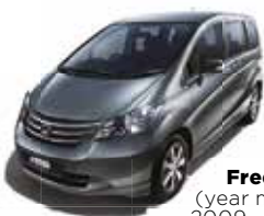
Freed (year model 2009 - 2012)