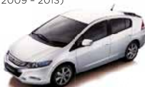
Insight (year model 2011 - 2013)