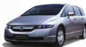
Odyssey (year model 2004 - 2008)