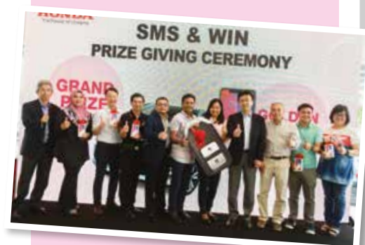
The management of Honda Malaysia and Tiong Nam Motor with the lucky winners of the CNY 'SMS & WIN' Contest.