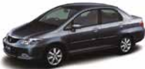
City (year model 2003 - 2008)