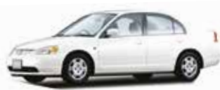
Civic (year model 2001 - 2005)