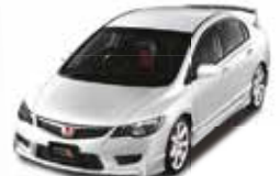
Civic Type R (year model 2007 - 2008 & 2010)