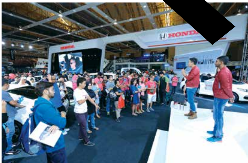
Above: The Lucky Draw at MAI Autoshow attracted a massive audience hoping to win Honda merchandise.

03 Explore Malaysia's most mesmerising mosques.