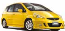
Jazz (year model 2003 - 2007)