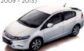
Insight (year model 2011 - 2013)