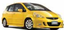
Jazz (year model 2003 - 2007)