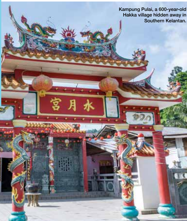
Kampung Pulai, a 600-year-old Hakka village hidden away in Southern Kelantan.

There's a Malaysia out there that you need to discover.