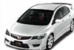
Civic Type R (year model 2007 - 2008 & 2010)