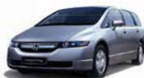
Odyssey (year model 2004 - 2008)