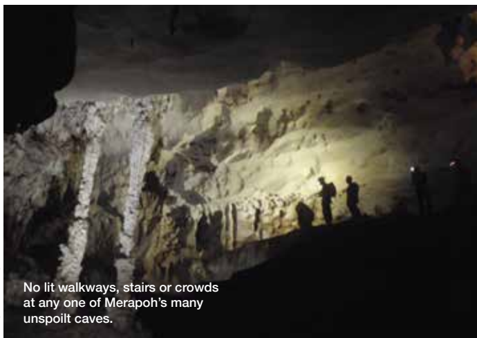
No lit walkways, stairs or crowds at any one of Merapoh's many unspoilt caves.