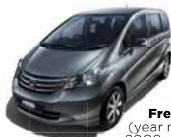
Freed (year model 2009 - 2012)