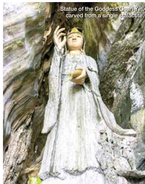
Statue of the Goddess Guan Yin, carved from a single stalactite.

If you've never considered being a local tourist, this article will convince you otherwise. Because while we may be familiar with the country's usual sights and attractions, there's a whole Malaysia out there that remains relatively under the radar.