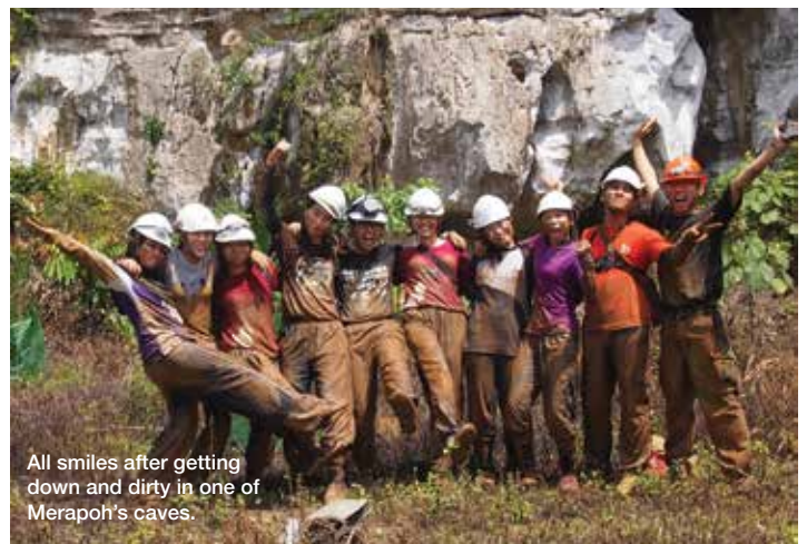
All smiles after getting down and dirty in one of Merapoh's caves.