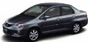
City (year model 2003 - 2008)