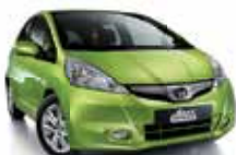
Jazz (year model 2009 - 2013)